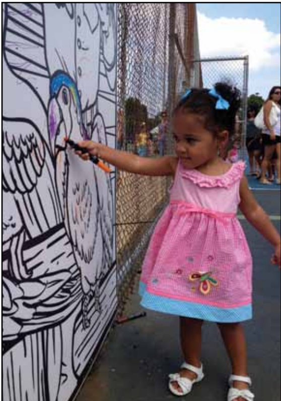
Douglas Park