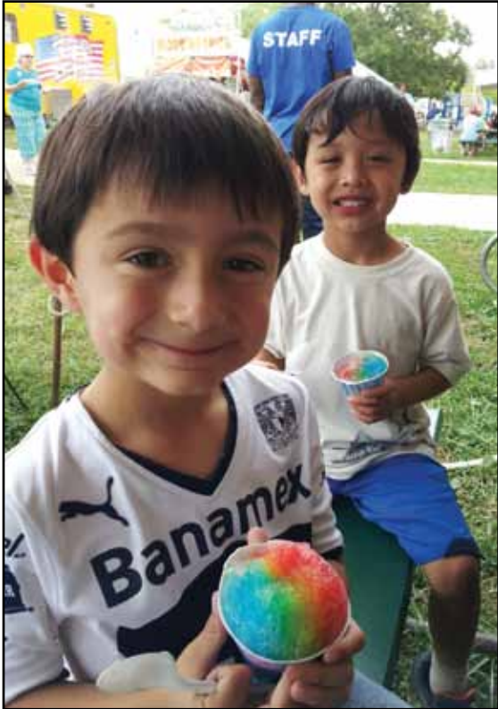
Cherrydale